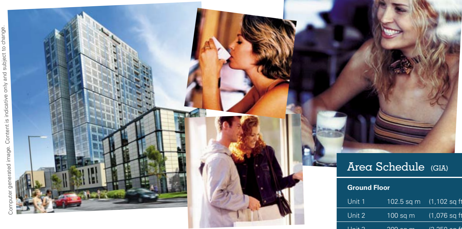
Computer generated image. Content is indicative only and subject to change.

The Galleries represents an outstanding opportunity to either purchase or lease retail or restaurant units fronting a landscaped public plaza within Image, Hemel Hempstead's prestigious town centre, mixed use redevelopment of Kodak's former European headquarters.